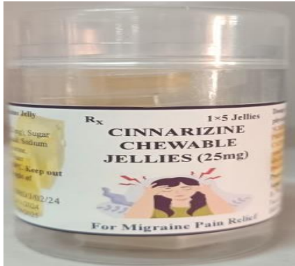
Cinnarizine Chewable Tablet