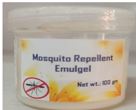
Mosquito Repellent Emulgel