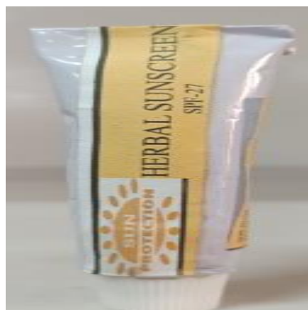
Herbal Sunscreen Cream