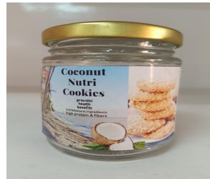
COCONUT NUTRI COOKIES