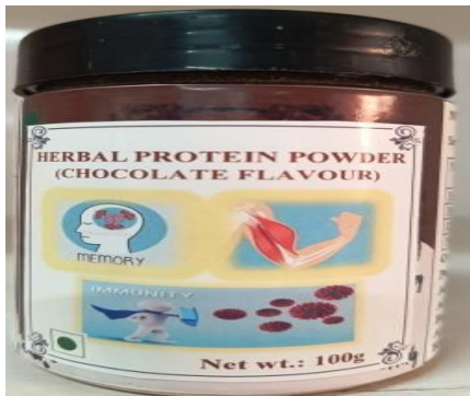
HERBAL PROTEIN POWDER