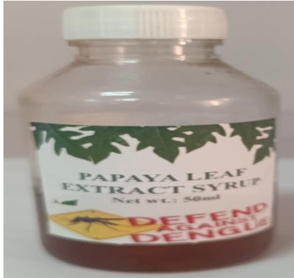
PAPAYA LEAF EXTRACT SYRUP