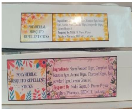
Herbal Protein Powder