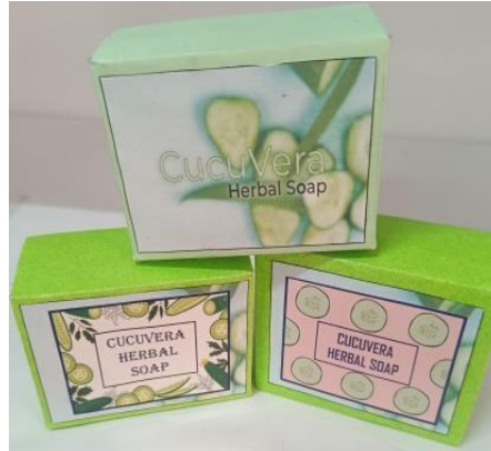
CUCUVERA HERBAL SOAP