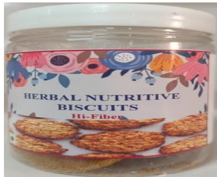
HERBAL NUTRITIVE BISCUITS